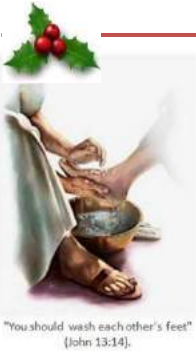
"You should wash each other's feet" (John 13:14).

The Mission Statement of People Helping People is... through social solidarity, to mobilize many people to help many people in a combat against poverty, hunger, illness, exclusion, indifference, intolerance, and social injustice, with a special preference for the last, the least and the lost, having as a model the person of Jesus, the «Good Shepherd» (Gospel according to Luke, chapter 15). Our wish is that it may always be an open door when all the other doors close, building in this way, different feelings and acts of Mercy (Gospel according to Luke, chapter 6 and Matthew chapter 25).